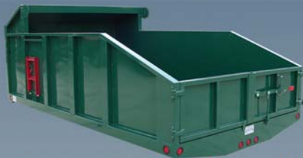
Canyon LS "Landscape"