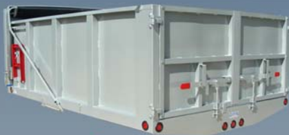
Aluminum Canyon *Shown with optional Tarp System*