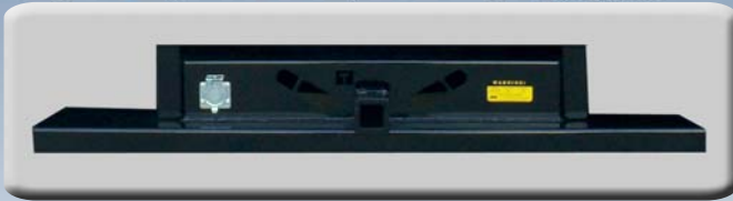
10,000# Receiver Hitch / ICC Bumper Sold Separately