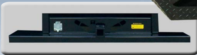
10,000# Receiver Hitch / ICC Bumper